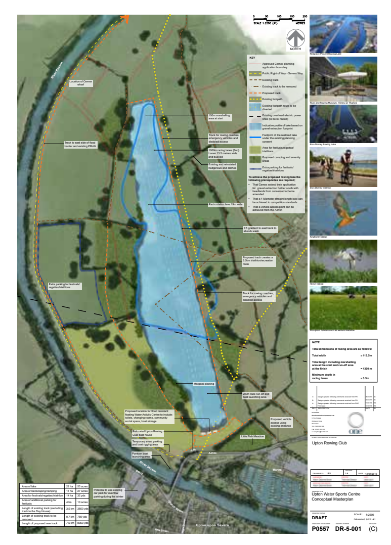
One helped visualise and create a vision of a water sports centre beyond our original idea of a rowing lake.

The proposal will address many of the previous constraints and provides a new centre with direct access onto the river, increased storage space for boats, provision of toilets, showers, changing facilities, gymnasium, catering and social areas and the provision of additional parking spaces. Additionally, it will also offer the opportunity for the club to hold regattas and time trial Head Race competitions.