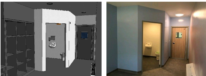
Revit Model showing Bedroom View